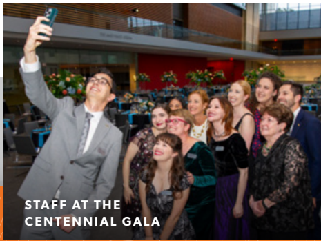
STAFF AT THE CENTENNIAL GALA