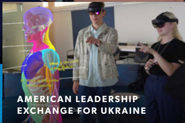
AMERICAN LEADERSHIP EXCHANGE FOR UKRAINE