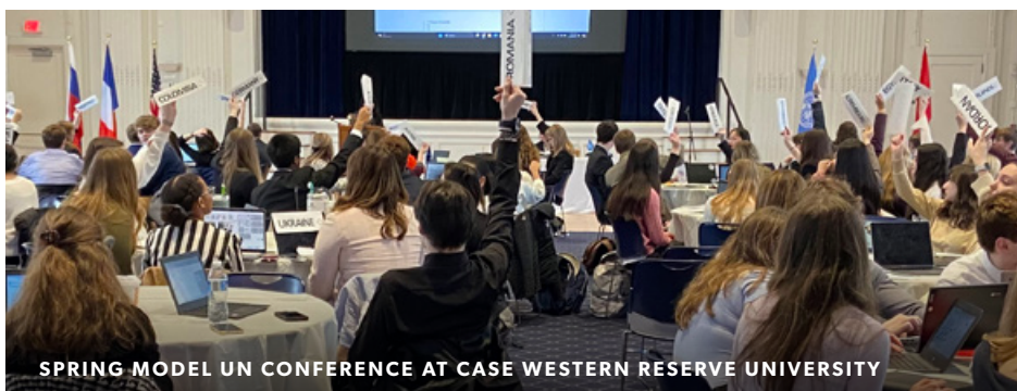
SPRING MODEL UN CONFERENCE AT CASE WESTERN RESERVE UNIVERSITY

BRIDGES TO THE WORLD | Our engagement with schools went far beyond Model United Nations. In the past year we've connected to countless classrooms across the region through our Bridges to the World program: we convened a global education roundtable for educators and school administrators; trained teachers on how to incorporate refugee issues into their curriculum across a diverse selection of subject areas; provided over 20 experiential learning sessions on diplomacy and refugee issues at local schools; engaged teachers in the U.S. Institute of Peace Day of Peace event; and hosted the local Academic WorldQuest competition.