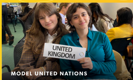
MODEL UNITED NATIONS