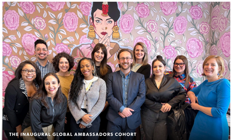
THE INAUGURAL GLOBAL AMBASSADORS COHORT

how these cities are leveraging their strengths as global cities, specifically in the areas of economic development, community building, and sustainability. They exchanged views with European leaders on best practices in these areas and strengthened ties between Helsinki, Madrid, and Cleveland. The Global Ambassadors returned to Cleveland, inspired by the experience, determined to help build a more global future for our city!