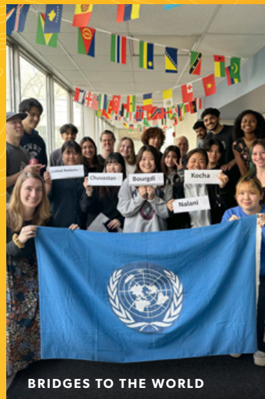
BRIDGES TO THE WORLD

"It has been an incredible experience to partner with CCWA to bring guest speakers to our school for small-group interaction or to attend speaker events in the evening. This partnership with CCWA helps to create experiences for my students that leads them at the end of the day to tell their parents, 'You won't believe what we learned in school today!'"