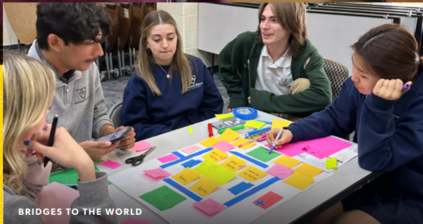
BRIDGES TO THE WORLD