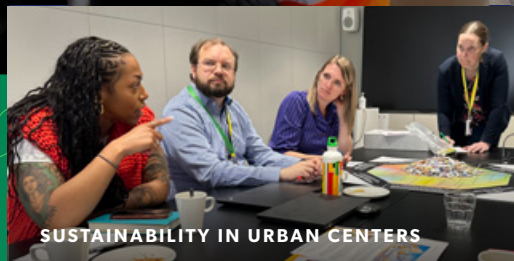
SUSTAINABILITY IN URBAN CENTERS