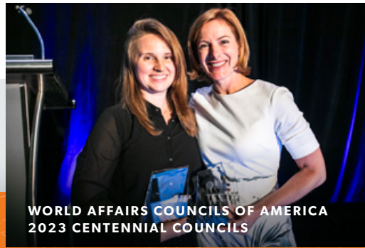
WORLD AFFAIRS COUNCILS OF AMERICA 2023 CENTENNIAL COUNCILS