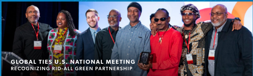
GLOBAL TIES U.S. NATIONAL MEETING RECOGNIZING RID-ALL GREEN PARTNERSHIP