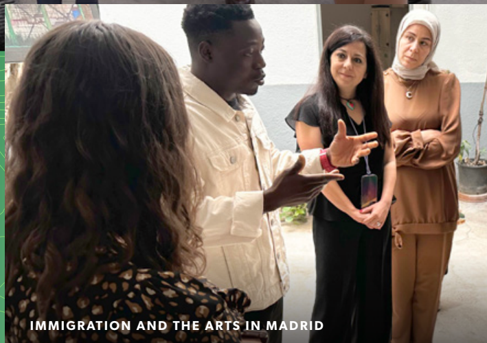
IMMIGRATION AND THE ARTS IN MADRID