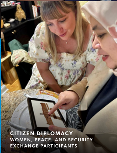
CITIZEN DIPLOMACY WOMEN, PEACE, AND SECURITY EXCHANGE PARTICIPANTS