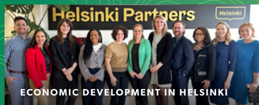
ECONOMIC DEVELOPMENT IN HELSINKI