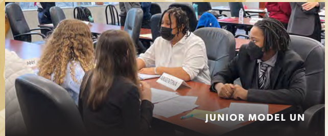
JUNIOR MODEL UN