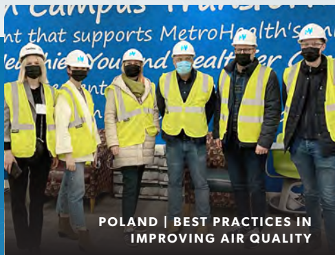
POLAND | BEST PRACTICES IN IMPROVING AIR QUALITY