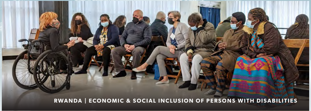
RWANDA | ECONOMIC & SOCIAL INCLUSION OF PERSONS WITH DISABILITIES