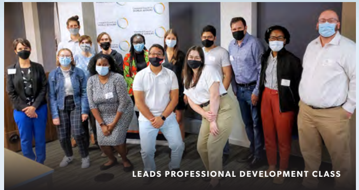
LEADS PROFESSIONAL DEVELOPMENT CLASS