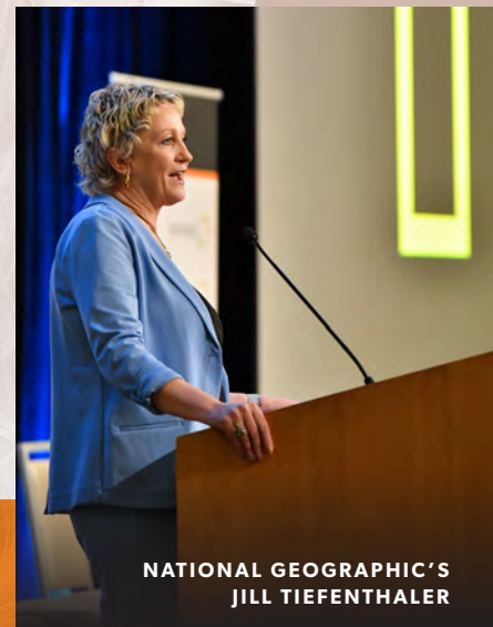
NATIONAL GEOGRAPHIC'S JILL TIEFENTHALER