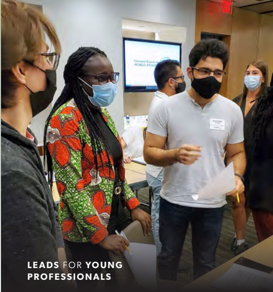
LEADS FOR YOUNG PROFESSIONALS