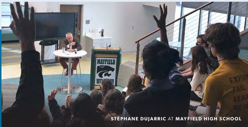
STÉPHANE DUJARRIC AT MAYFIELD HIGH SCHOOL