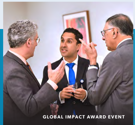
GLOBAL IMPACT AWARD EVENT