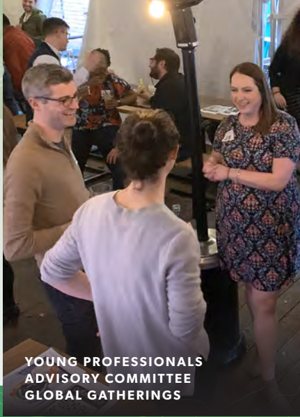
YOUNG PROFESSIONALS ADVISORY COMMITTEE GLOBAL GATHERINGS