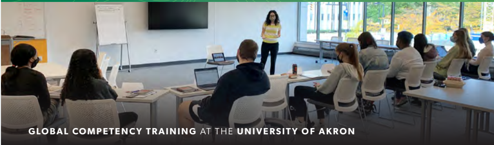
GLOBAL COMPETENCY TRAINING AT THE UNIVERSITY OF AKRON